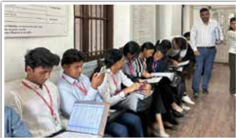
Wilson Placement Drive