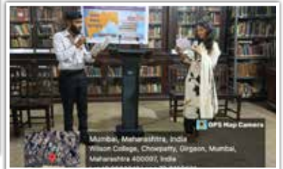
वाचन संकल्प महाराष्ट्राचा