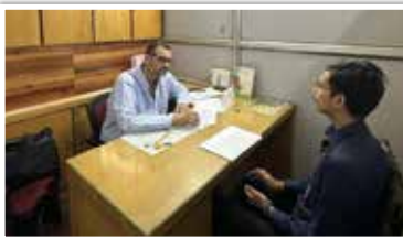
Wilson Placement Drive