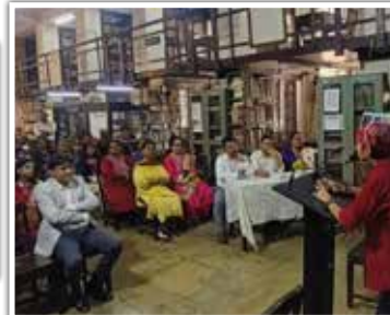
वाचन संकल्प महाराष्ट्राचा