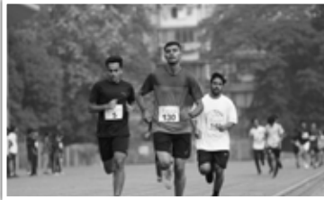
Annual Sports Day Glimpses