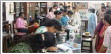
Microscopic learning - a vision to discover