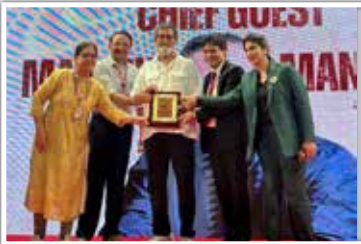
Annual Fest Glimpses