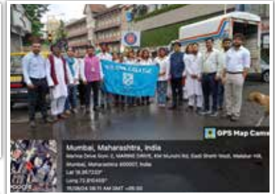
हर घर तिरंगा रॅली विल्सन महाविद्यालय, मुंबई